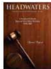
Issue 13, Fall 2006

Legal Brief • In the News • A River In Debt • San Luis Valley Waits for Judicial Ruling • Denver Basin Aquifers • South Platte Well Owners In Crisis • Colorado Ground Water Commission • River of Words Poetry Winners