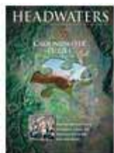
Issue 12, Summer 2006

Published three times a year, Headwaters magazine has become a trusted source for up-to-date news from the world of Colorado water. This year, the magazine focused on groundwater, energy and added a special report edition that complements the Citizen's Guide on Colorado Water Law by discussing court decisions affecting the law since the Guide's publication.