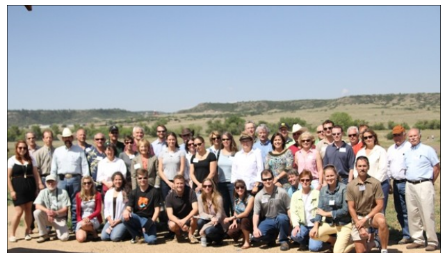
2012 South Metro Area Water Tour Attendees