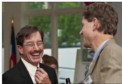
The evening was full of laughter with friends.