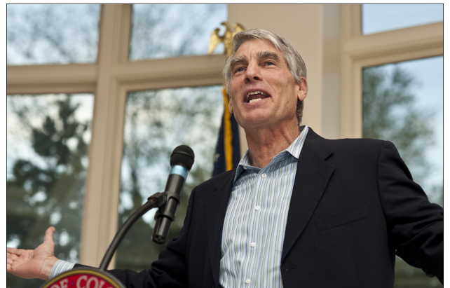
Senator Mark Udall addresses the crowd