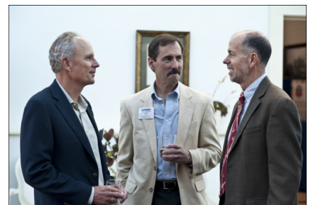
Guests enjoyed catching up with colleagues.