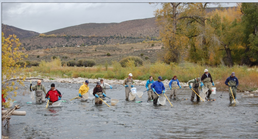
Attendees at the 2011 Sustaining Colorado Watersheds Conference get their feet wet at the electrofishing workshop on the Eagle River